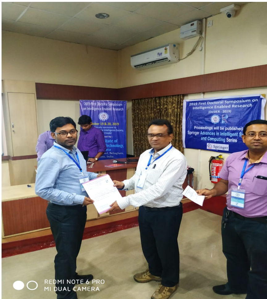
Valedictory Session in DoSIER 2019: Handover Certificate to an Author