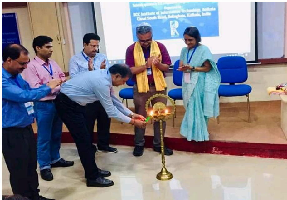
Inauguration Ceremony of DoSIER 2019