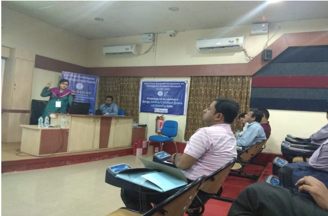
Paper presentation by an Author in DoSIER 2019