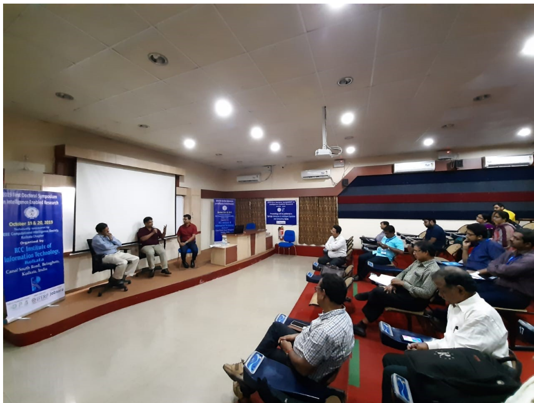
Panel discussions in DoSIER 2019