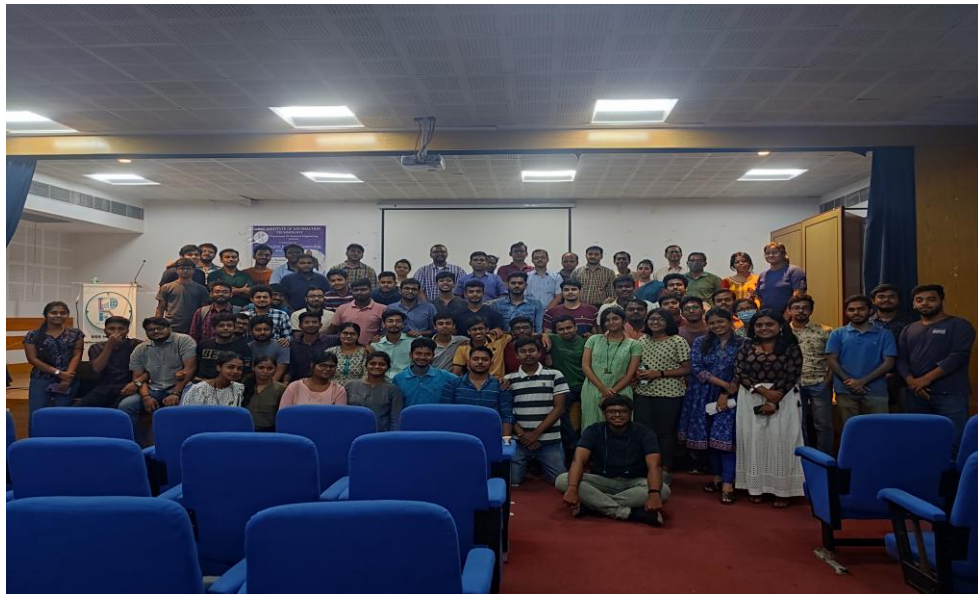
Group photo at the end